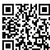
WNCC Foundation Timeline

The WNCC Foundation could not support the needs of the Panhandle and WNCC students without your donations. To learn more about how you can give to support a WNCC student, visit wnccfoundation.org or call us at 308.630.6550.