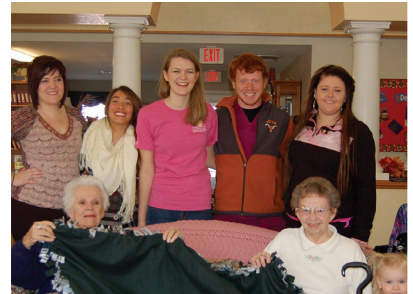
Every year, WNCC - Sidney Campus gives back to its surrounding communities by donating blankets to panhandle long term care facilities, including living centers and nursing homes.

Giving back is something that's woven into the fabric of any meaningful and successful organization's culture. At Western Nebraska Community College, our charitable activities foster a culture of caring, and bring people together to work jointly for a greater impact to drive change. We're honored to be embedded in the communities we serve, and proud of the contributions made by our faculty and staff.