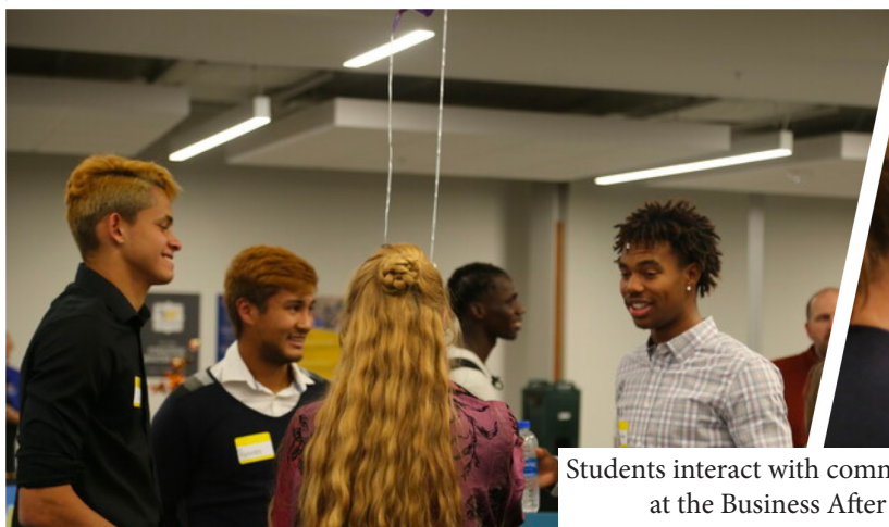
Students interact with community professionals at the Business After Hours event