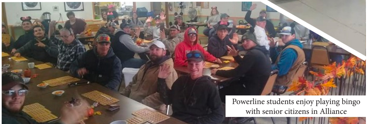
Powerline students enjoy playing bingo with senior citizens in Alliance