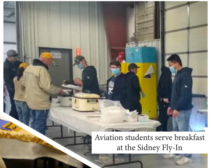
Aviation students serve breakfast at the Sidney Fly-In