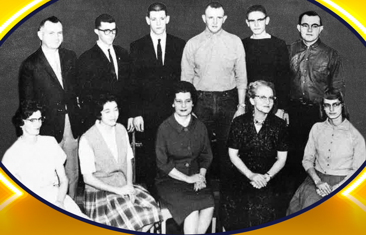
PICTURED ABOVE: INAUGURAL PTK HONOR SOCIETY 1961