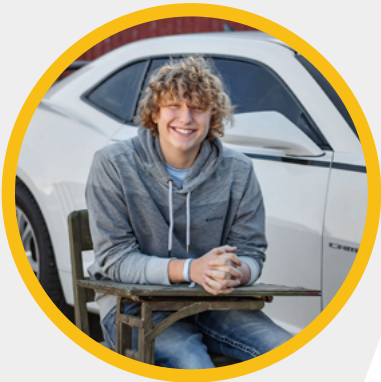
Mary Forrester Nursing Alliance, NE

You have no idea how much it means to me to receive scholarships, as my goal is to graduate without having financial burden on my parents.